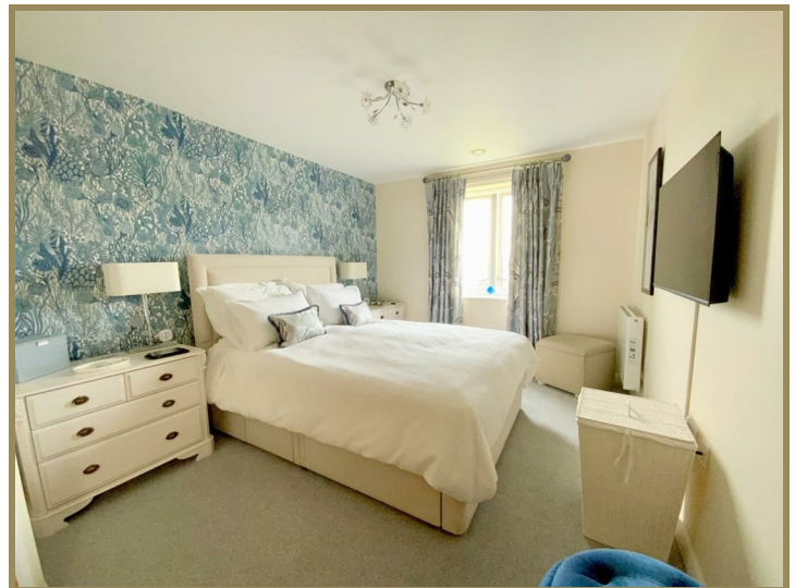
32 Maritime Court, Taylors Avenue, Cleethorpes, DN35 0AP £230,000